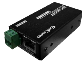
Receiver (Camera Side)