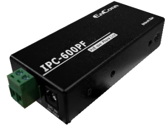
Transmitter (Network Side)