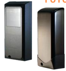
FOTO30-A / FOTO30-B