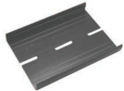
QM100 Quick Mount for easy mounting of receivers on walls.