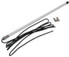
Suitable Antennas ANT433 series (433MHz Series) or 27MHz Series