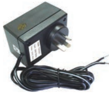
Suitable Power packs 12PP-1000 , 12V DC 1000mA 24PP , 24V DC 500mA.