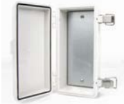
Weatherproof Case for receiver unit