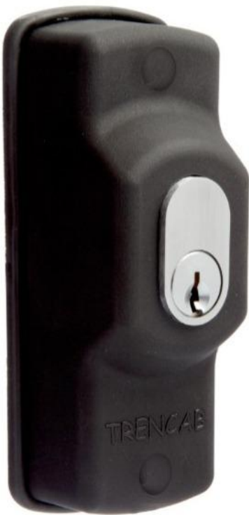
Rubber Gasket, Screw Cover Caps

Ideal override keyswitch for Gates, Doors, Boom Gates, etc.