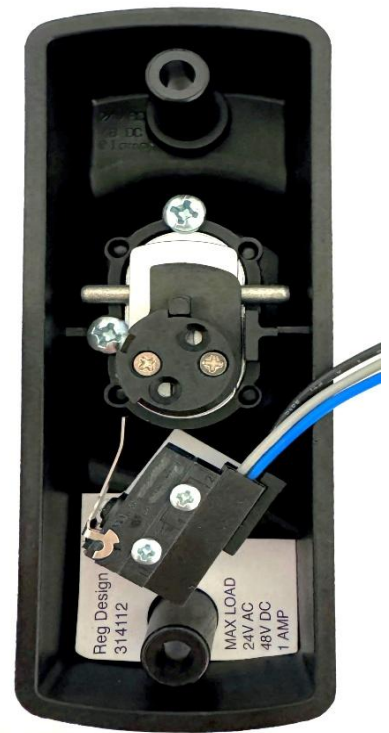
Install Cams which are included to change function to Key Removable OFF or ON Do not over tighten Cam Screws