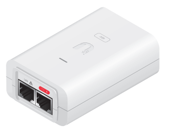
POE-48-24W-WH POE-24-24W-G-WH POE-48-24W-G-WH