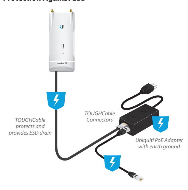
Ubiquiti PoE Adapters and TOUGHCable protect against ESD events in a network.