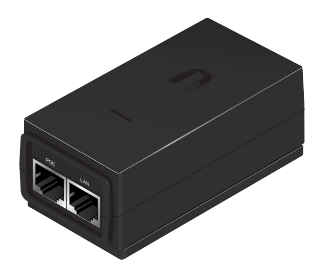
POE-15-12W POE-24-12W POE-24-12W-G