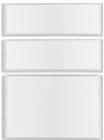
42920.K - 1-2-4 button kit for RFID Video kit plat