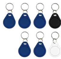
40169 - 7 Mifare RFID keys