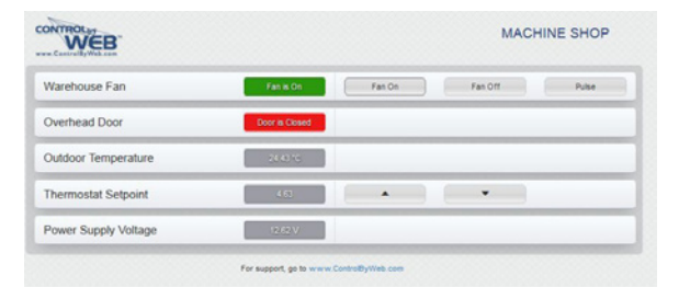
Example Control Page